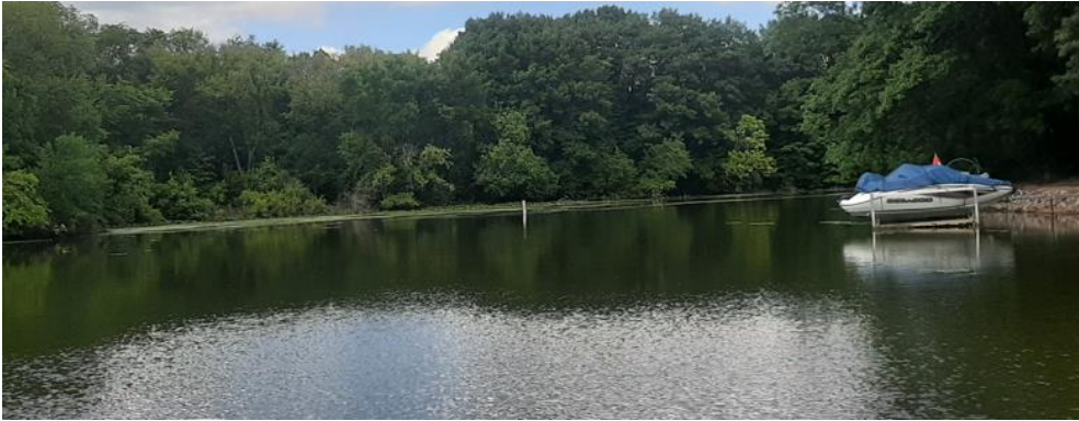
Arboretum corner on Elm Creek