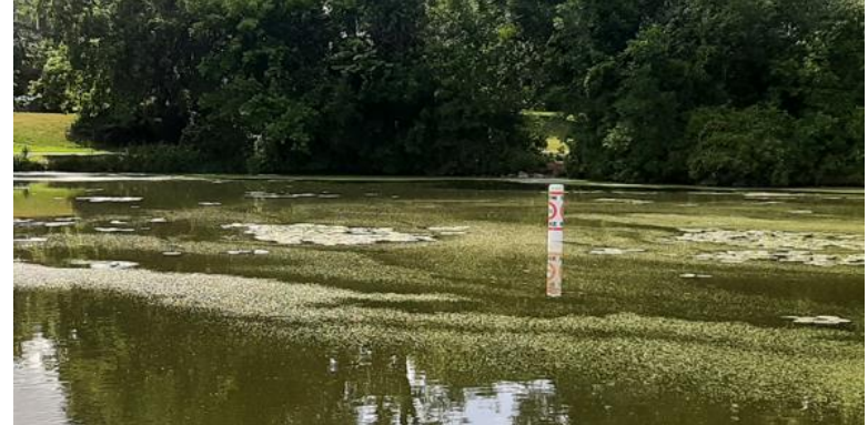
Tristan Bay corner northwest of footbridge