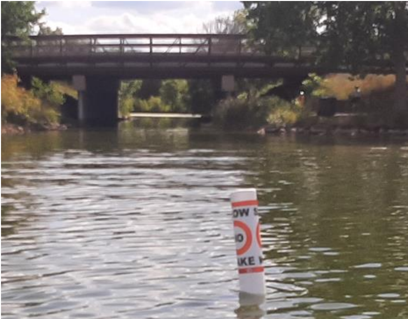
Creek entrance to lake under I-94 bridge (north)